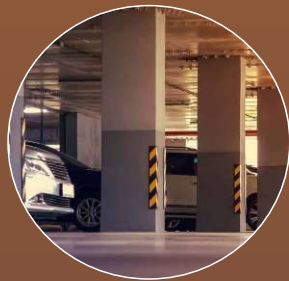
Covered Car Parking for each Flat.

Vaibhav's Vimal Ezhilagam is a classy Ground plus 3 floors Residential Building comprising of 5 Apartments with 1 Commercial Area and all modern amenities, bringing luxury living at Medavakkam.