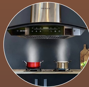
Modular Kitchen with Chimney