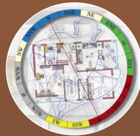
Architectural Design and Vaastu plan